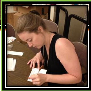
"FREE" Packing Party for Homeless Outreach September 2015