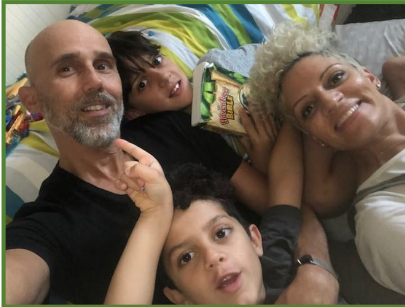
Bible Time Bonding with the Renz Family