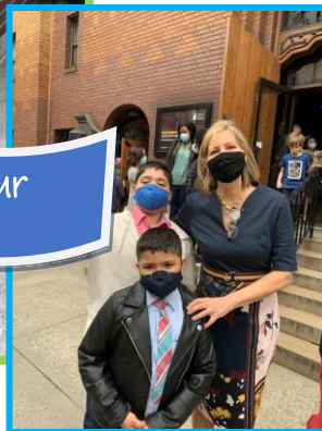
Sidewalk Coffee Hour